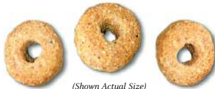
(Shown Actual Size)

Now an "O" that's nutritionally formulated for birds.